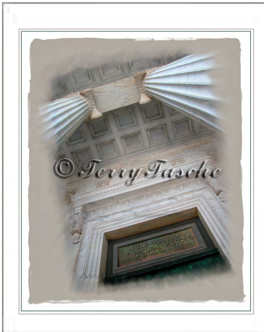
“Grand Entrance” by ©Terry Tasche